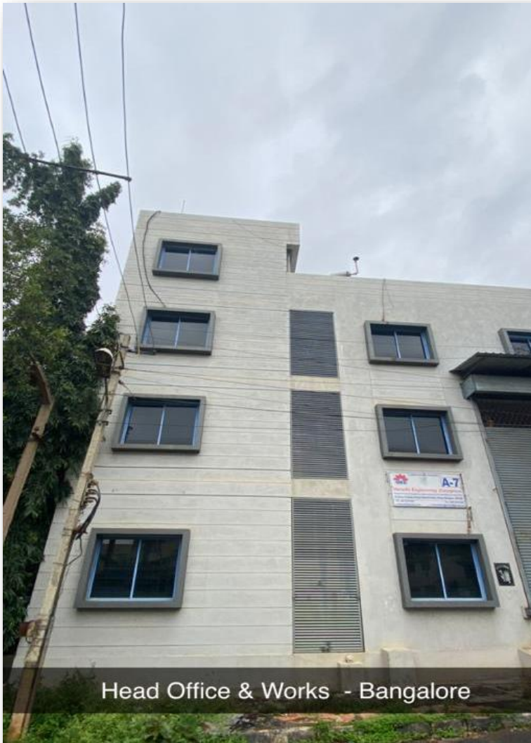
Head Office & Works - Bangalore

HEAD OFFICE AND WORKS OF MARUTHI ENGINEERING ENTERPRISES IS PRIMELY LOCATED AT A-7, 1ST CROSS, 1ST STAGE, PEENYA INDUSTRIAL ESTATE, PEENYA, BANGALORE — 560058.