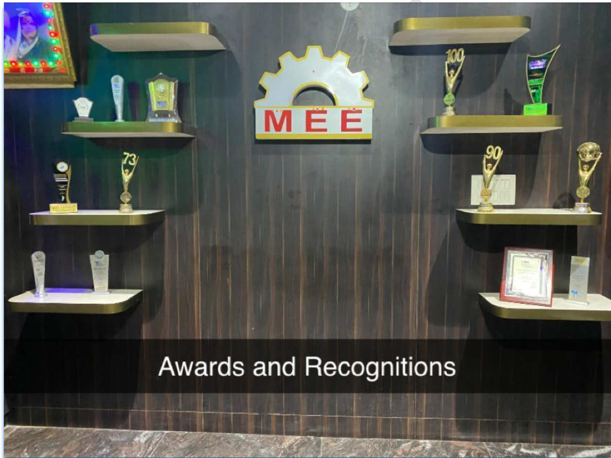
Awards and Recognitions